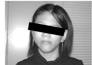
Fig. 3. Close-up Shot Asymmetry